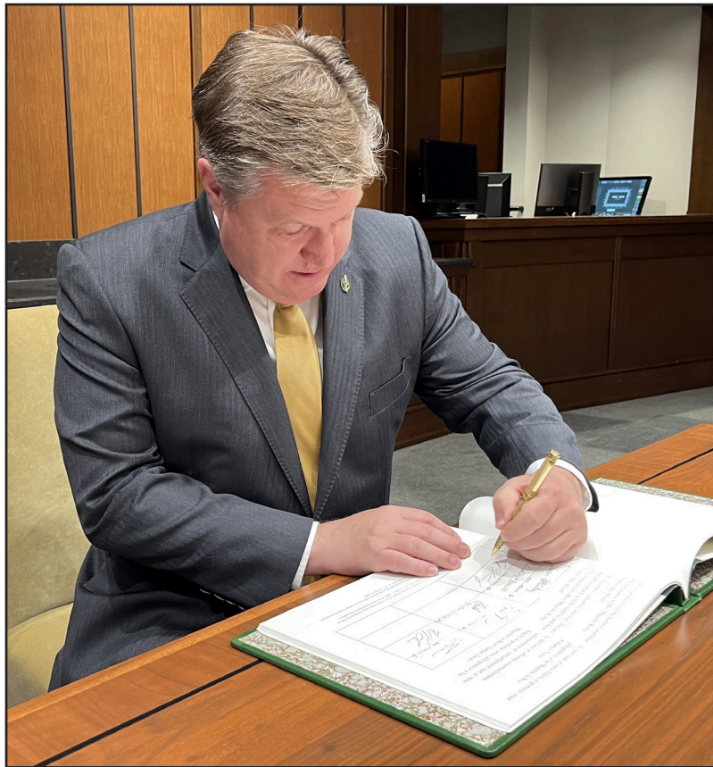
Signing the register as the Member of Parliament for Calgary Crowfoot.