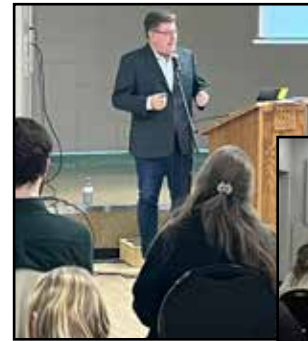
◀◀ The always well-attended Silver Springs Community Association AGM.

Retaliatory tariffs are applied to goods coming into Canada, so when you buy that California head of lettuce, you will pay another tax on top of a price that already reflects many business and consumer taxes (such as the carbon tax on the truck fuel that brought it here). 🍁