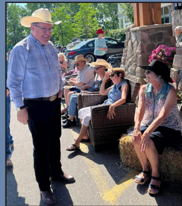
Rocky Ridge Retirement Community