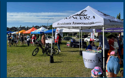
Kincora Community Association