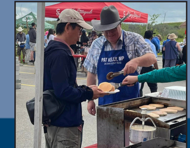
Royal Oak Rocky Ridge Community Association and YMCA Calgary