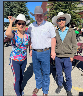
St. James Church Breakfast in Ranchlands