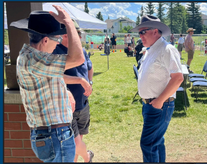
Citadel Community Association