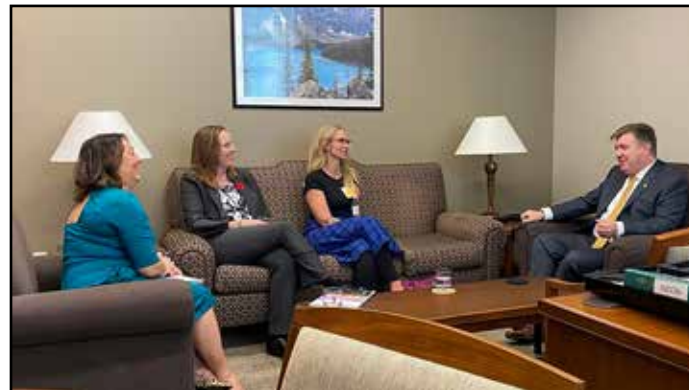
(Above) I met with Alberta teachers (including two from Calgary Rocky Ridge), in Ottawa for the Teachers Institute on Parliamentary Democracy program.