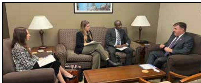
I met with the Canadian Bankers Association and had a frank discussion about mortgage renewals. Thousands of Canadians don't know what they will do when their mortgages renew: a typical mortgage payment will more than double.