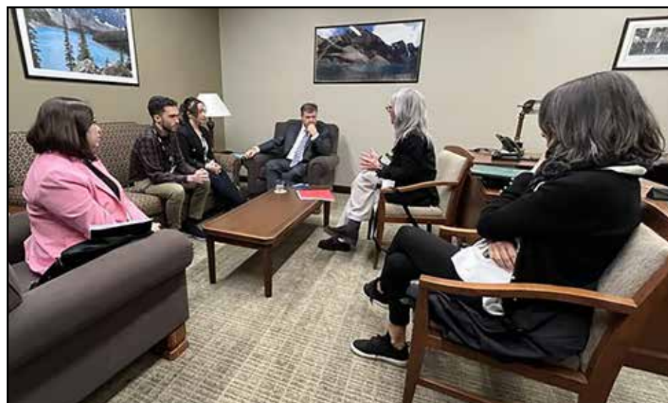
(Below) I met with The Centre for Israel and Jewish Affairs Delegates at the Antisemitism: Face It Fight It Conference and heard first hand about how antisemitism affects our community.