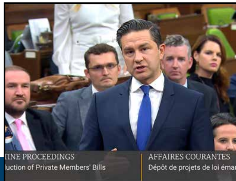
THE PROCEEDINGS Session of Private Members' Bills AFFAIRES COURANTES Dépôt de projets de loi éman