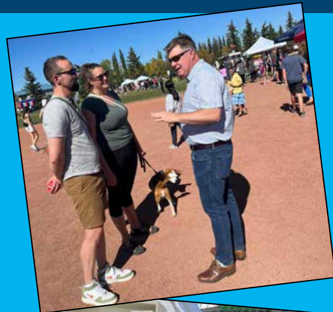
In mid-September I enjoyed the Harvest Fall Festivals in both Tuscany and Hawkwood.