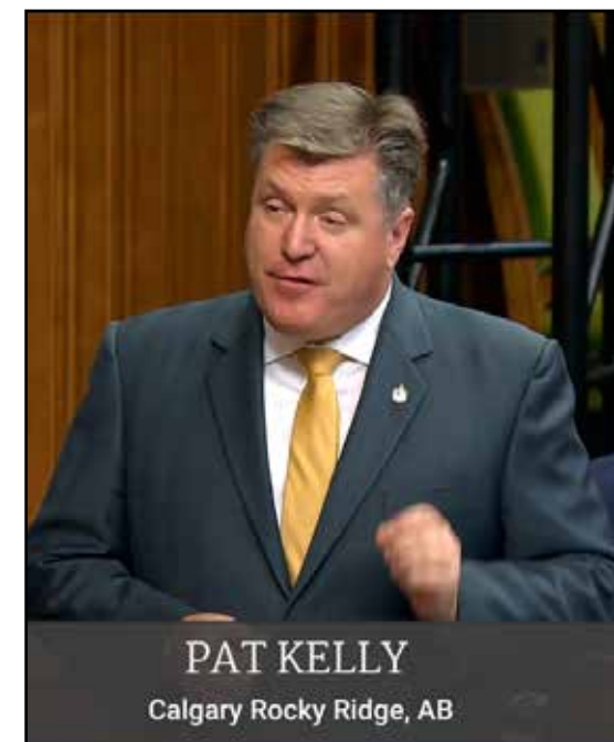
PAT KELLY Calgary Rocky Ridge, AB

House of Commons, Statement on Housing, Sept 26, 2023