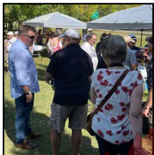
At the Botanical Gardens of Silver Springs Autumn Garden Party & Data Base Launch. I grew up nearby and have watched this determined group of volunteer gardeners turn a former freeway setback into amazing gardens and forest. A 100% volunteer community effort.