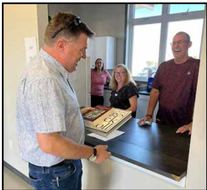
Adding to my book collection at the Citadel Book Sale.