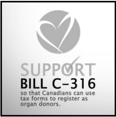
More information about this bill is available at http://www.lenwebber.ca/