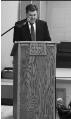
Community AGMs in Scenic Acres , Silver Springs , and Sherwood . Good to see so many residents out to hear about the hard work done by these volunteer associations.