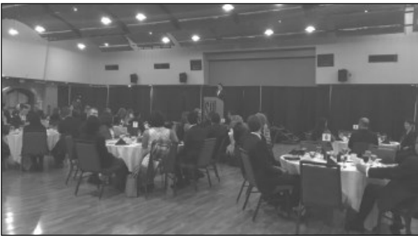
U of C Students Union Leaders Dinner.