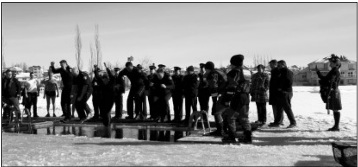
5th Annual Polar Plunge at Arbour Lake. Participants were Freezin' for a Reason —funds were raised in support of Special Olympics .