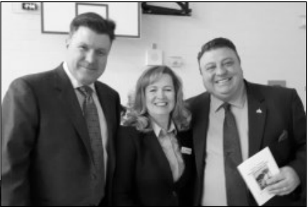
Celebrations of new schools in Royal Oak and Evanston !

Please contact my office with details if you are hosting a Canada 150 celebration. I will attend if I am available.