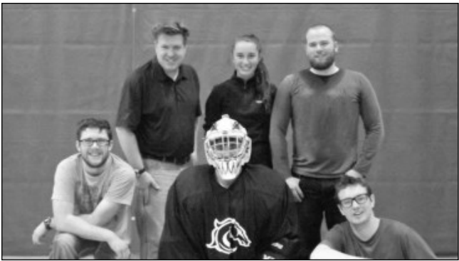
Fun evening of floor hockey at MRU.