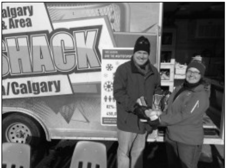
Helped out at the Skate Shack for the Ranchlands Winter Fest .